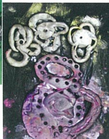
India Kutch Pottery - 2D Clay-work