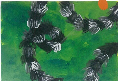
The Lemur Tail - Gouache Painting

Children shall strengthen their observation skills as they learn about the tail structure and movement of the endangered Lemur species. They will learn to use different lines to imply the soft texture of the Lemur's tail while at the same time, apply contrasting warm and cool colors using gouache painting to achieve the aesthetic presentation of their artwork. Painting allows children to improve their eye hand coordination and to practice the proper pincer grip in holding the art brush.