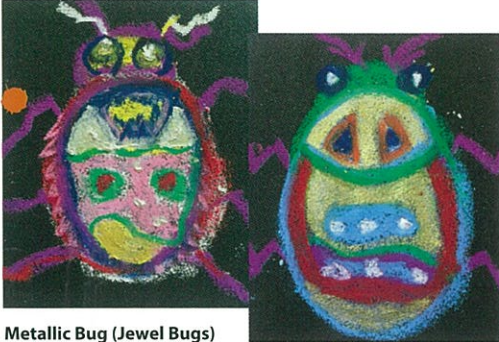
Metallic Bug (Jewel Bugs) - Oil Pastel Rendering

Discover all about the colourful beaked Toucan! Children will experiment with different colored clays as they learn about contrasting colour schemes to create this contemporary portrait inspired by American Pop-Artist, Andy Warhol. Clay modeling provides very good opportunities for children to strengthen their small finger and hand muscles as they pinch, roll and knead the clay to form their artwork.