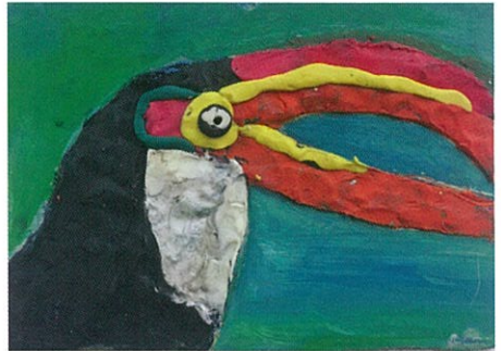
Toucan - Gouache Painting & Clay-work

Discover all about the colourful beaked Toucan! Children will experiment with different colored clays as they learn about contrasting colour schemes to create this contemporary portrait inspired by American Pop-Artist, Andy Warhol. Clay modeling provides very good opportunities for children to strengthen their small finger and hand muscles as they pinch, roll and knead the clay to form their artwork.