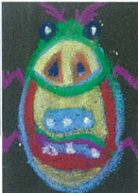
Metallic Bug (Jewel Bugs) - Oil Pastel Rendering