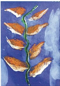
Helleconia - Oil Pastel & Watercolor Rendering