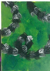
The Lemur Tail - Goache Painting