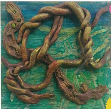
Swinging lianas - Gouache Painting & Clay-work

Have you wondered how Tarzan swings from tree to tree? With the help of Lianas! Children shall observe the Lianas and identify the different organic lines (i.e. twisted, curvy, twirling) and its variations in thickness and directions while creating this long stemmed and woody vine which is commonly found in the rain forest. They shall apply gouache painting technique and engage in playful clay-work to develop their fine motor skills through rolling, pinching and kneading.