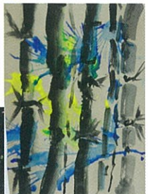
Bamboo - Chinese Painting